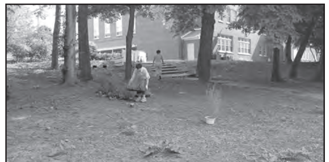
Cleared county property adjacent to the church